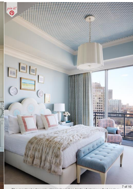
The master bedroom's atmosphere has hints of glamour that spring from the velvet coverlet, faux-fur throw and custom wallpaper on the ceiling by Stephen Floyd Design.