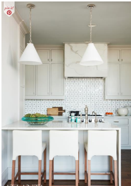
The petite kitchen is big on style with a custom tiled New Ravenna backsplash in a flower pattern. Pendants, Visual Comfort.