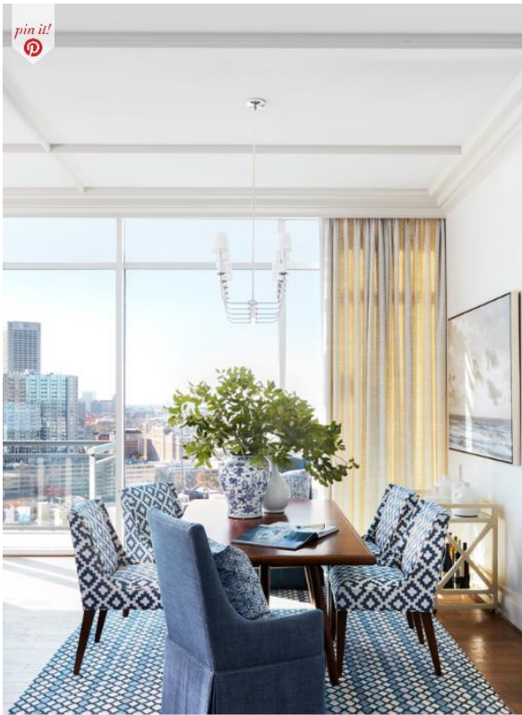
The horizontal light fixture in the dining room is hung higher than average so as not to block the view from the adjoining kitchen. Blue linen host chairs, Lee Industries. Chandelier, Visual Comfort.